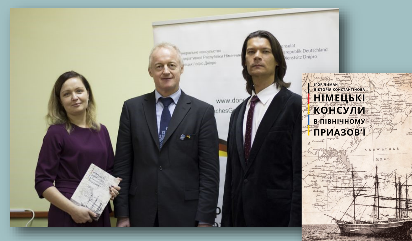
Presentation of the monograph "German Consuls in the Northern Azov Region" organized by the Consulate General of Germany in BSPU

Quality Assurance System in Ukraine: Development on the Base of ENQA Standards and Guidelines (QUAERE) (№ - 562013-EPP-1-2015-1-PL-EPPKA2-CBHE-SP)