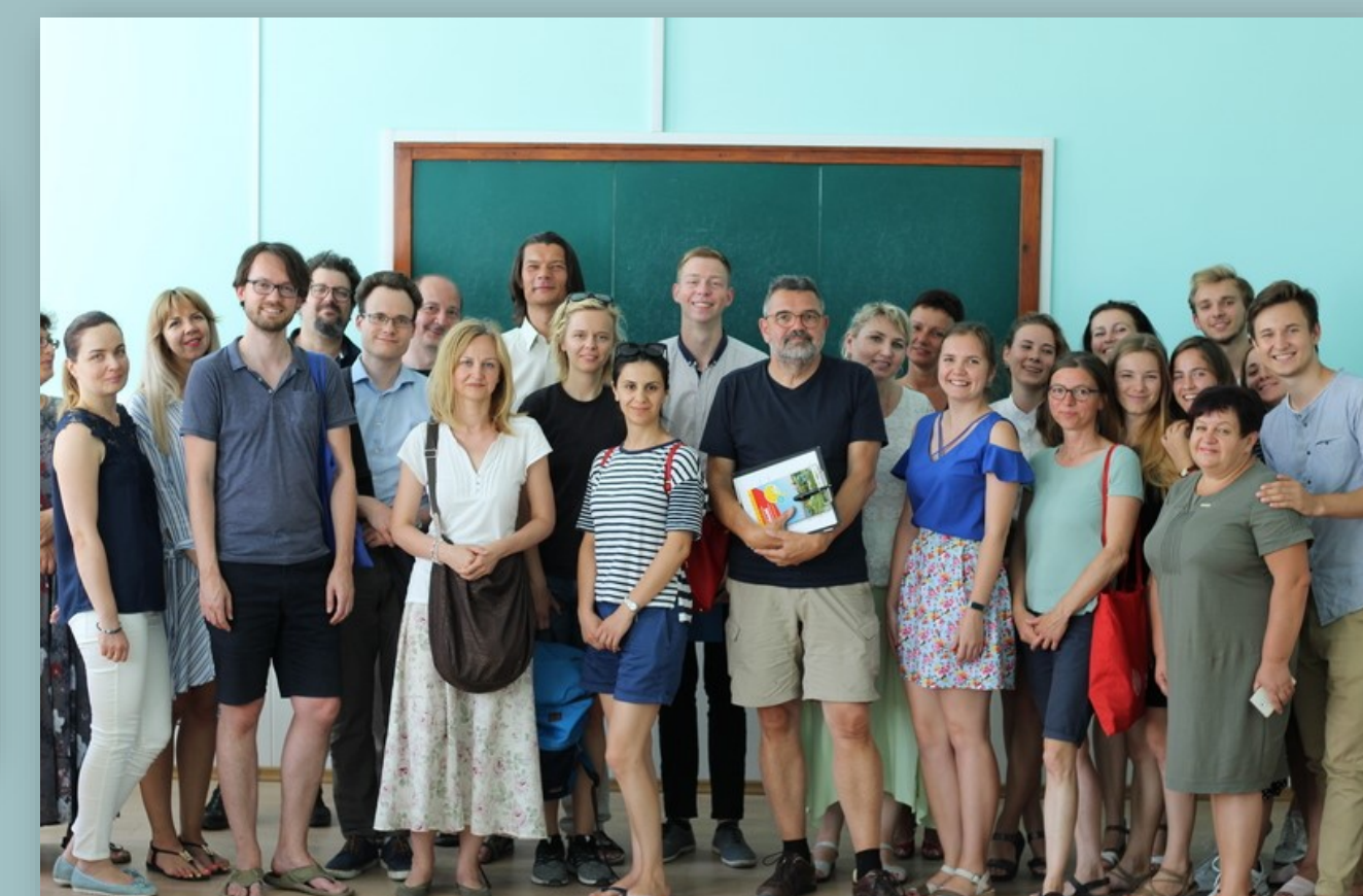
Teachers and PhD students delegation of Leipzig University in BSPU