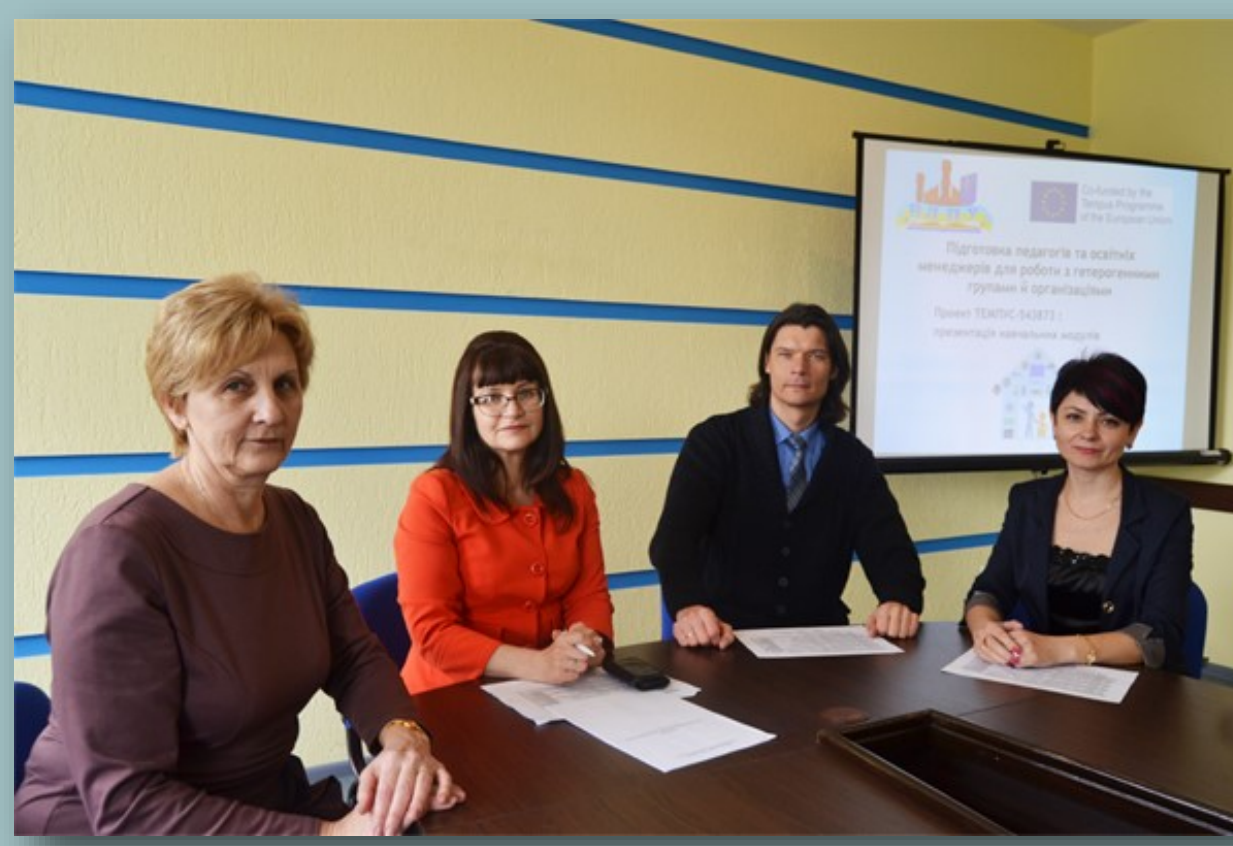
TEMPUS project team of BSPU