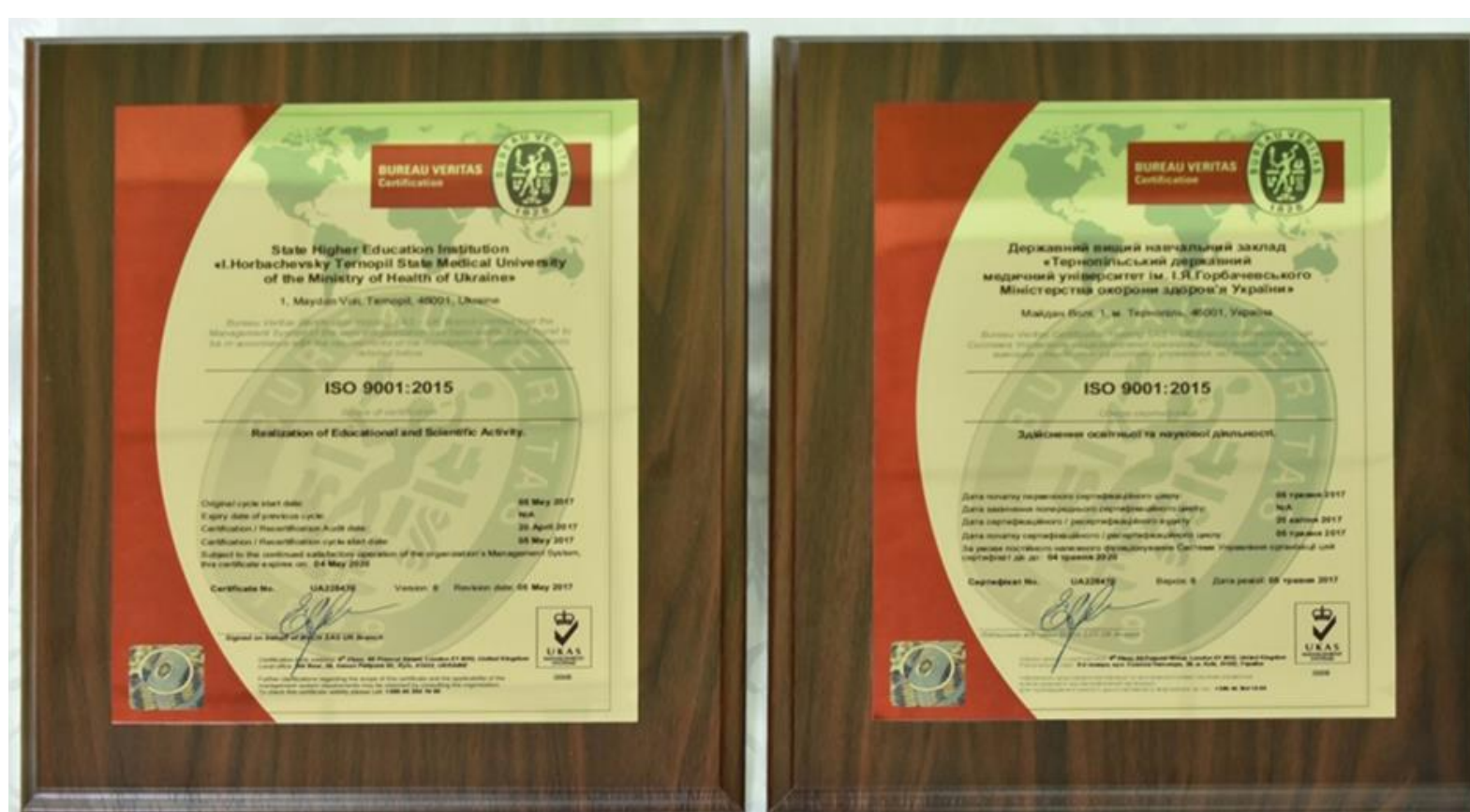
Certificate of Quality management ISO 9001:2015