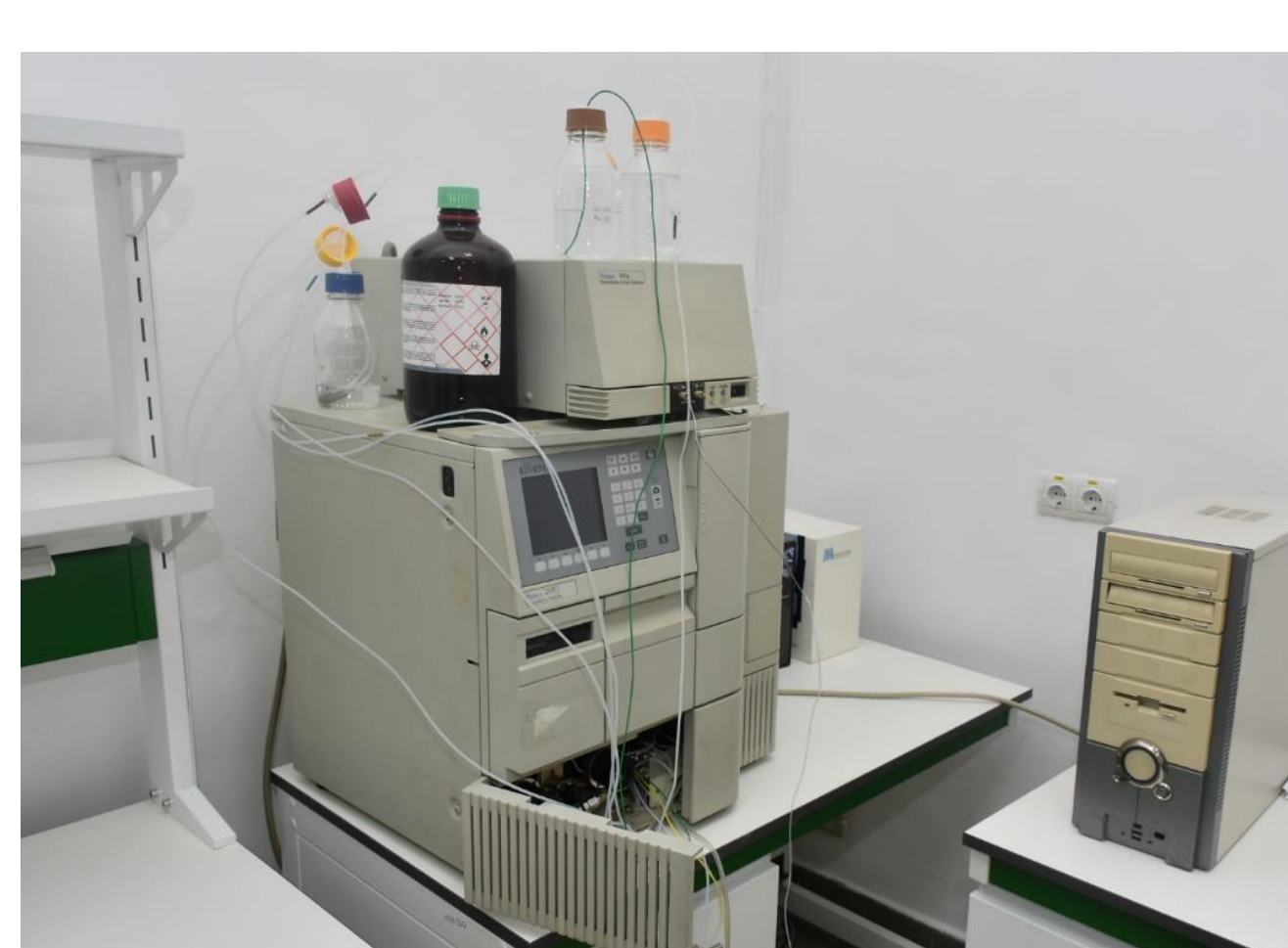
Analytical Chemistry Lab