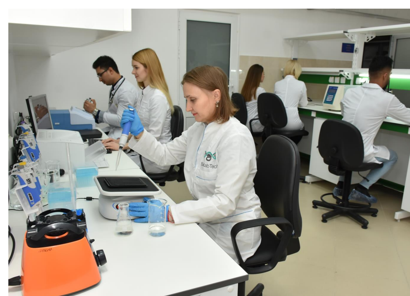
Central Research Lab