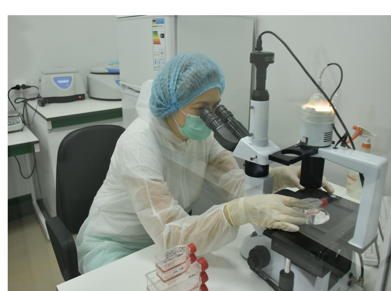
Cell Culture Lab